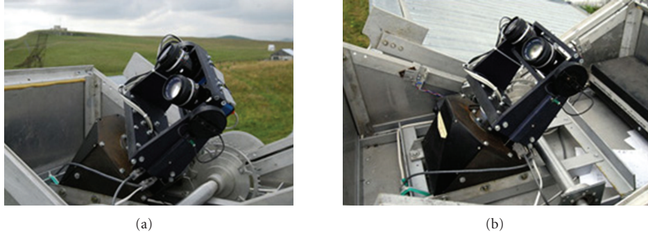
FIGURE 2: There are 4 MASTER VWFs located at Kislovodsk observatory.