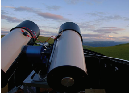
FIGURE 1: MASTER-II system in Kislovodsk observatory ( D = 400 mm).

70 clear nights per year and most of them are summer white nights). However, we observed several tens of error boxes during five years (HETE and Swift epochs), and in most of the cases our observations were the earliest [2].